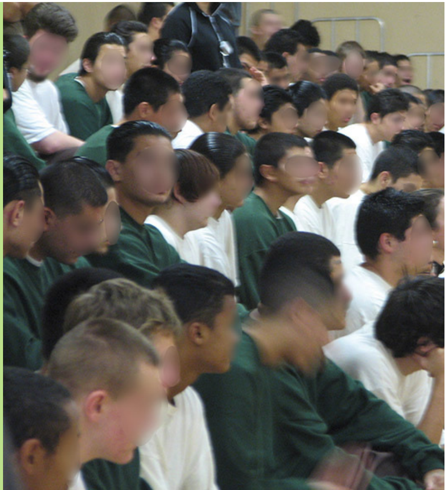
Incarcerated youth at Juvenile Hall are primarily people of color.

Our hope is to add a few trickles to what may one day be "like a mighty stream" of minorities into the fields of math, science, engineering and technology. Then their God-given talents and gifts will flow forth to form a type of "Joseph's technocracy of many colors" workforce working together to create the future of our community."